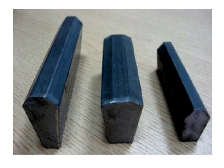
Grade: >450 HBN Lengths: 3000mm (standard length)

GROUSER BARS are steel bars welded to the incline of the wheel covers to provide traction for heavy vehicles and are used to replace the grouser treads on tracked vehicles when they have worn down. GROUSER BARS have proved to be the better solution in hard rock mining and extreme tar sand operations.